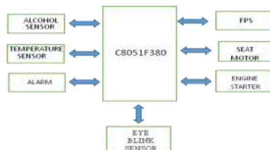
Fig. Block diagram