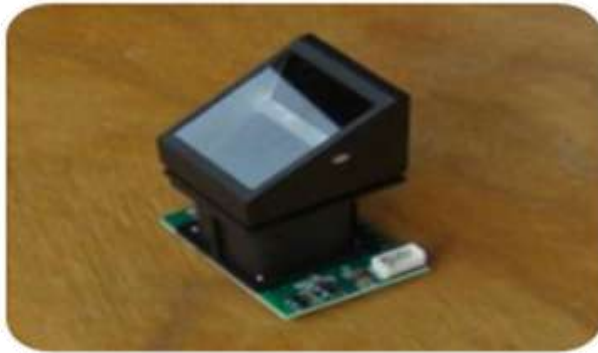
Fig:finger print scanner system

The FPS system stores up to 120 users supported to enrolled, additional to that it have SEARCH,DELETE,ALL DELETE,VEIFY PASSWORD, commands.