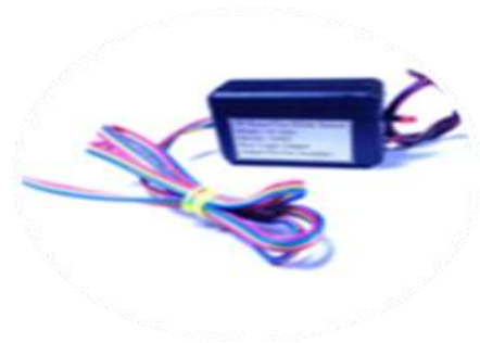
Fig:Eye blink sensor module

high otherwise output is low. This to know the eye is closing or opening position. This output is give to logic circuit to indicate the alarm. This can be used for project involves